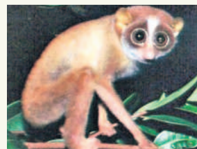
Malabar Slender Loris

In the process, they have concluded that both, due to their genetically diverse