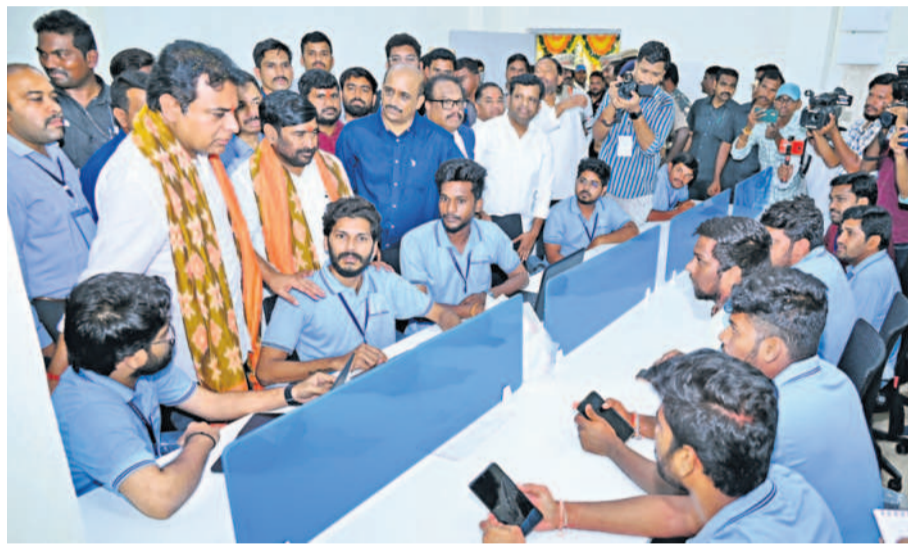
Industries Minister KT Rama Rao during the foundation-laying ceremony for the IT tower at Malakpet on Monday.

Speaking after laying the foundation stone for an IT