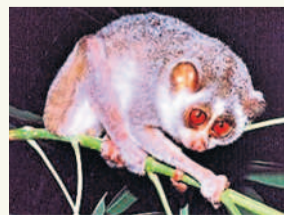
Mysore Slender Loris

For the first time in the country, researchers from the Hyderabad-based Centre for Cellular and Molecular Biology (CCMB) have sequenced the entire genome of lesser-known but critically endangered species of Mysore Slender Loris and Malabar Slender Loris.