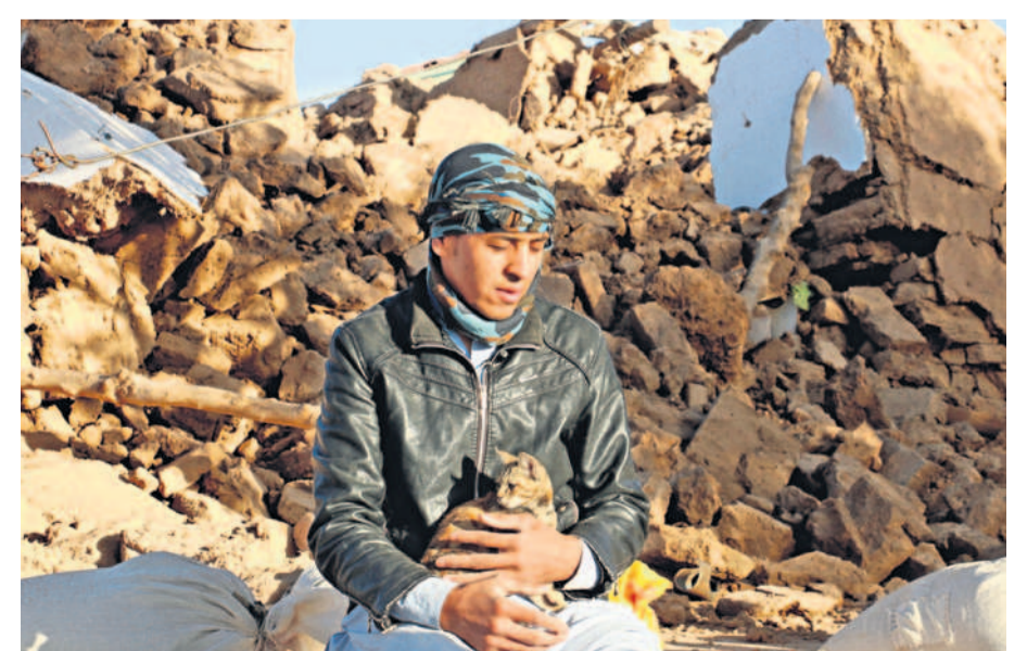
An Afghan boy hold his cat as he sits in a courtyard of his destroyed home after an earthquake in Zenda Jan district of Herat province, west Afghanistan, on Sunday.