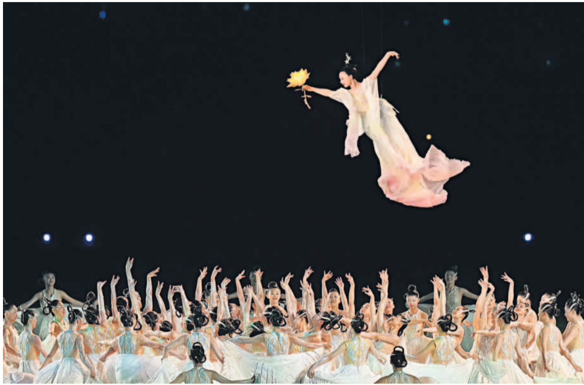
IN SYNC: Artists perform during the closing ceremony of the 19th Asian Games in Hangzhou, China, on Sunday.