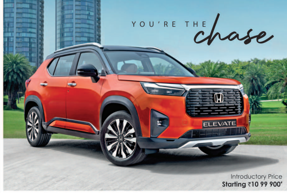
Introducing the Boldly Stylish and Comfortable Honda Elevate