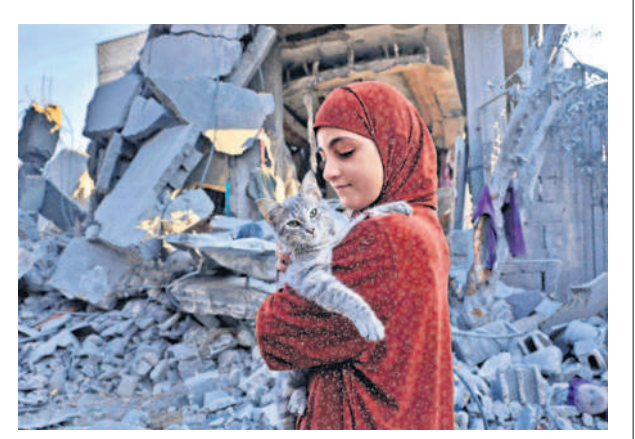
A Palestinian girl carries a cat as she inspects the damage caused by Israeli bombardment in Rafah, Gaza Strip.

President Joe Biden vowed to show the world that the US stands in solidarity with Israelis during his visit there on Wednesday, and offered an assessment that the deadly explosion at a Gaza Strip hospital apparently was not carried out by the Israeli military.