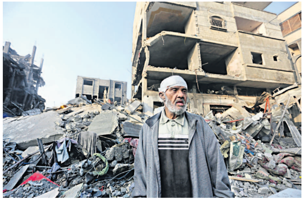
UNENDING CONFLICT: A Palestinian stands outside a building destroyed in Israeli bombardment of the Gaza Strip in Rafah on Wednesday. (REPORTS PAGE 9)