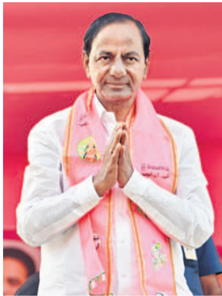
UNDER 'KCR BHAROSA', BRS ACTIVISTS WILL EXPLAIN THE PARTY'S ELECTION MANIFESTO, COMPRISING 16 MAJOR PROMISES, TO BE IMPLEMENTED UPON GETTING RE-ELECTED FOR THE THIRD TERM IN TELANGANA

Rama Rao also urged the public not to be swayed by Congress' promises. He advised against risking the stable growth of Telangana by trusting the Congress. He asserted that if given a chance, the people of Telangana would suffer a similar fate as that of Karnataka.