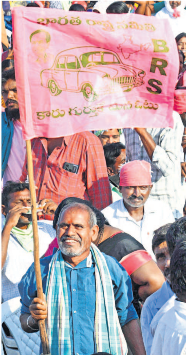
A BRS supporter at the Praja Ashirvada Sabha in Palair on Friday.

Says it will scrap all welfare schemes if the party is voted to power