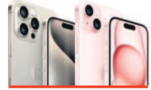
Wistron board approves plan for sale of India unit to Tata Group for about $125 mn

Tata Group is all set to become the first Indian iPhone maker as Wistron's board has approved the plan for the sale of its India plant to the salt-to-software conglomerate.