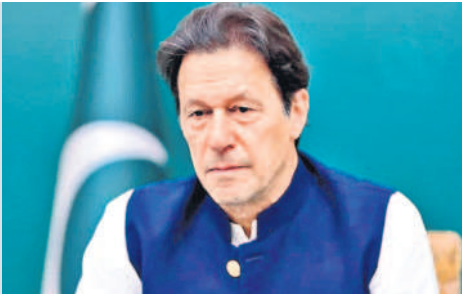
WORLD | PAGE 09 Court setback for Imran Khan in cipher case Rejects petitions seeking post-arrest bail and the quashing of the FIR in the case