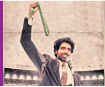
ENTERTAINMENT | PAGE 12 First look of Arjun Chakravarthy unveiled