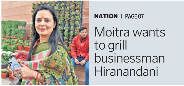
NATION | PAGE 07 Moitra wants to grill businessman Hiranandani