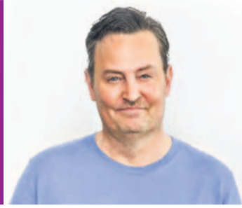
ENTERTAINMENT | PAGE 12 Friends star Matthew Perry found dead in LA