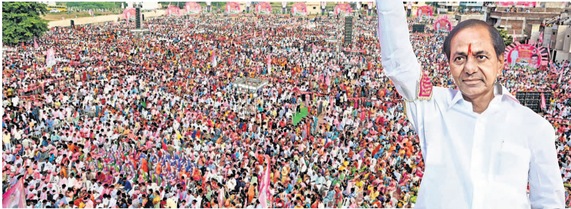
A section of the crowd at the BRS Praja Ashirvada Sabha at Thungathurthy on Sunday. Chief Minister K Chandrashekhara Rao at the venue.

Ridiculing TPCC chief A Revanth Reddy's remarks that