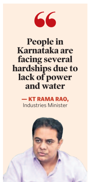
Slamming the Congress, he sought to know the credibility of the leaders to seek votes in Telangana, while

Responding to Karnataka Deputy Chief Minister DK Shivakumar's offer to visit Karnataka and check about the implementation of welfare programmes, the BRS working president said there was no necessity for that as farmers from the neighbouring State were already visiting Telangana in batches and cautioned the farming community here about the Congress government's failure in extending sufficient power supply.