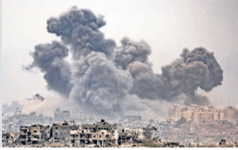
WORLD | PAGE 09 Israel unleashes fierce attacks on Gaza Hits region's largest hospital; jets strike 450 Hamas targets in last 24 hours