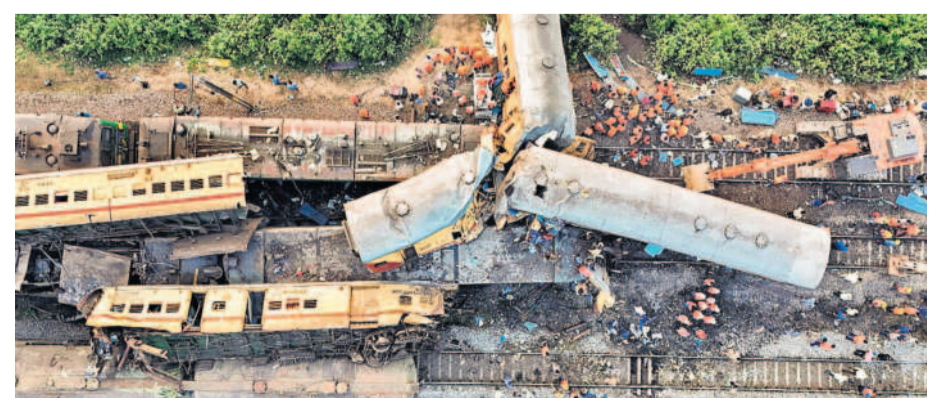
A search and rescue operation underway in Vizianagaram on Monday. (REPORTS PAGE 7)

The toll rose to 14 and the number of injured stood at 50 in the collision involving two passenger trains on the Howrah-Chennai line. The report said seven experts, who have signed it, carefully examined the accident site, available evidence,