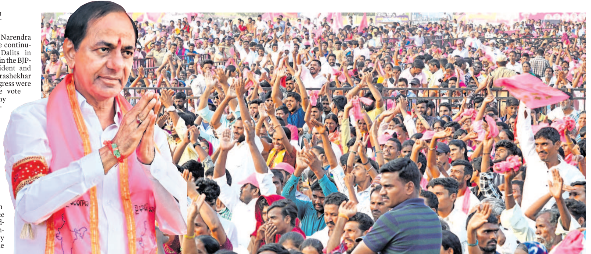
BRS president and Chief Minister K Chandrashekhar Rao at the Praja Ashirvada Sabha rally in Yellandu on Wednesday.

"In North India, there are attacks on Dalits every day. In Uttar Pradesh, Bihar, Madhya Pradesh, Rajasthan and even the Prime Minister's home State of Gujarat, attacks are going on against Dalits. Women are being raped. What is this plight? Are we a democratic country? Why this anarchy?" he asked. The BRS chief recalled that he had initiated