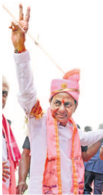
BRS supremo and Chief Minister K Chandrashekhar Rao during his election campaign at Bhainsa on Friday. (RELATED REPORTS PAGE 5)

Farmers from the adjacent pockets in Maharashtra were preferring to buy at least a piece of land in Telangana. It was because they were certain of getting water here and round-the-clock supply of free power. They were collecting water from local sources and pumping it across the inter-