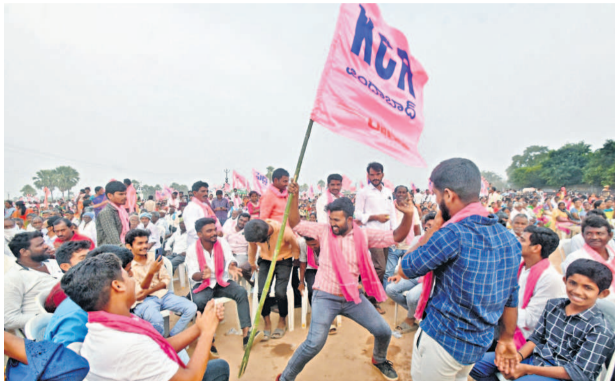
A BRS follower dances as others cheer him during Chief Minister K Chandrashekhara Rao's public meeting at Narsampet on Monday.

KCR tears into Revanth for his lack of knowledge in agriculture