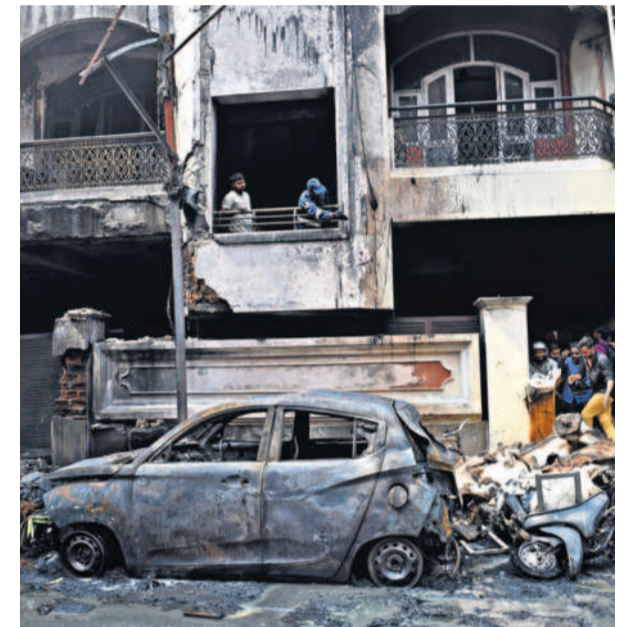
A car which was gutted in the fire at a residential building in Bazar Guard, Nampally, on Monday.