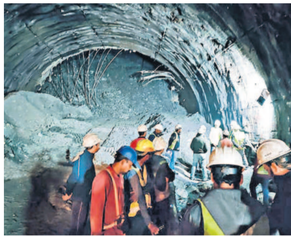
Rescue workers at the site after the tunnel collapsed in Uttarkashi district of Uttarakhand.