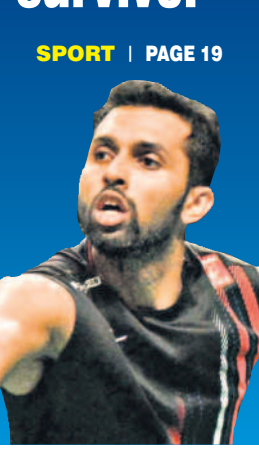
lone Indian survivor