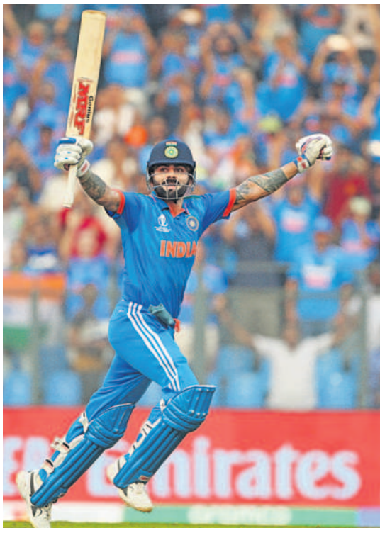
TAKE A BOW: Virat Kohli celebrates his century during the semi-final match against New Zealand, at Wankhede Stadium. (REPORTS PAGE 18)