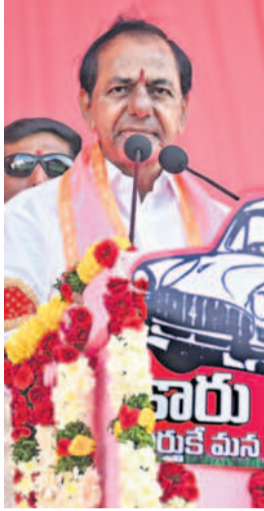
BRS president and Chief Minister K Chandrashekhar Rao during his Praja Ashiravada Sabha at Kollapur on Sunday.

The return of Indiramma Rajyam would only pose a threat to Telangana's survival, he said, asserting that the forthcoming Assembly election was a matter of life and death for the people of Telangana. "People were forced to either migrate or queue up in front of ganji kendrams (porridge centres) to survive. Indiramma Rajyam marked the worst