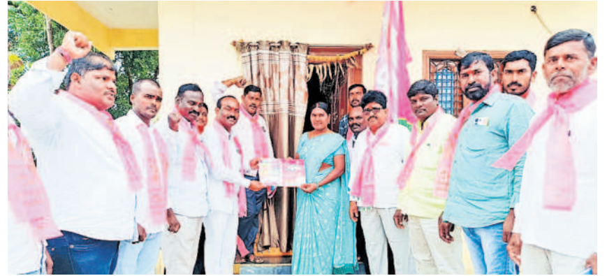
నంగునూరు : మైసంపల్లిలో ఇంటింటి ప్రచారం చేస్తున్న బిఆర్ఎస్ నాయకులు