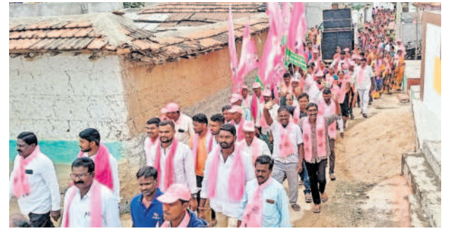
నారాయణరావుపేట: గోపులాపూర్లో ర్యాలీ నిర్వహిస్తున్న బిఆర్ఎస్ నాయకులు, కార్యకర్తలు, ప్రజాప్రతినిధులు