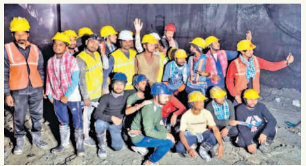
The workers, who were trapped in the Silkyara tunnel, before they were rescued, in Uttarkashi.

The 22-year-old hailing from Jharkhand had a close brush with death after a portion of the Silkyara tunnel on the Brah-makhal-Yamunotri national highway in Uttarakhand collapsed early on November 12. "Loud shrieks punctuated the air... We all thought we