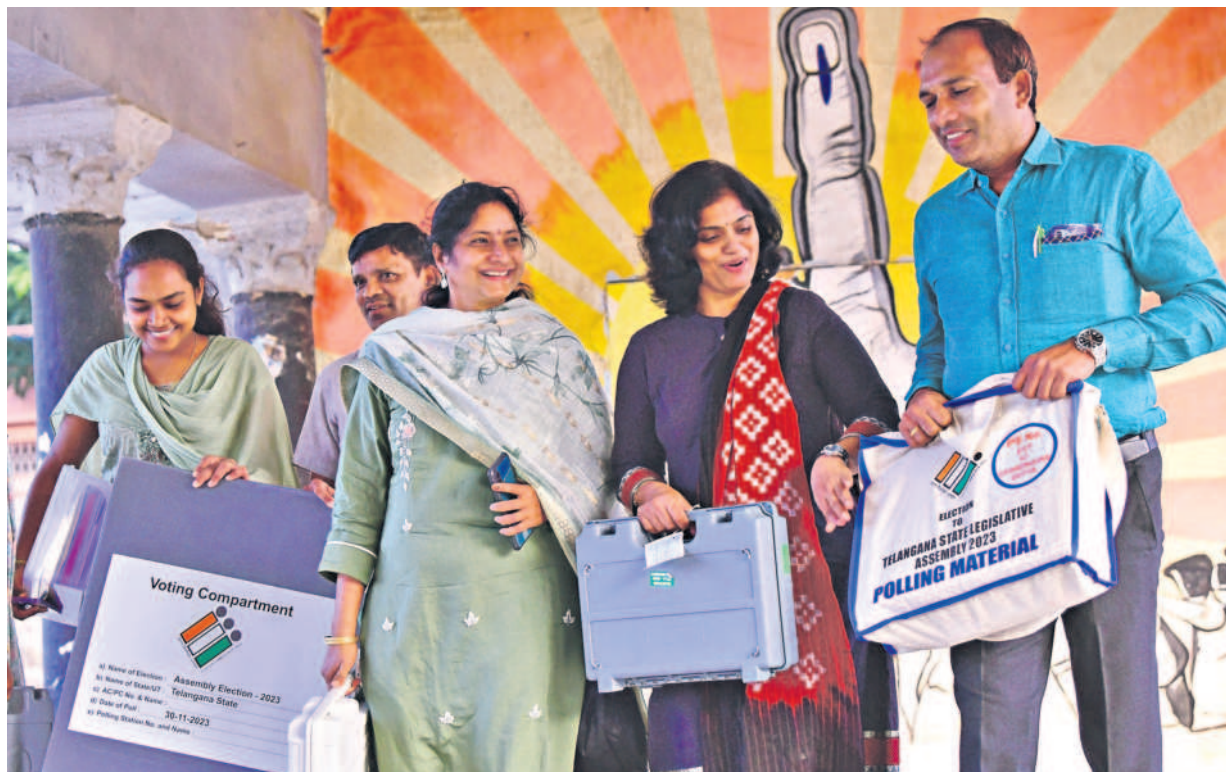
Officials carrying EVMs and other poll-related material ahead of voting, at Nizam College in Hyderabad.

The Election Commission of India's (ECI) arrangements for polling include 1.85 lakh polling personnel and 22,000 micro observers to monitor the polling process. Security will be provided by a total of 45,000 personnel from the State, 3,000 from other departments, 50 companies of the Telangana State Special Police (TSSP) and 375 companies of the Central Paramilitary Forces.