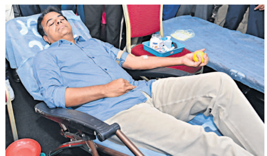
BRS working president and IT Minister KT Rama Rao during a blood donation camp held on the occasion of Deeksha Diwas, in Hyderabad on Wednesday.

KTR optimistic of party winning key seats