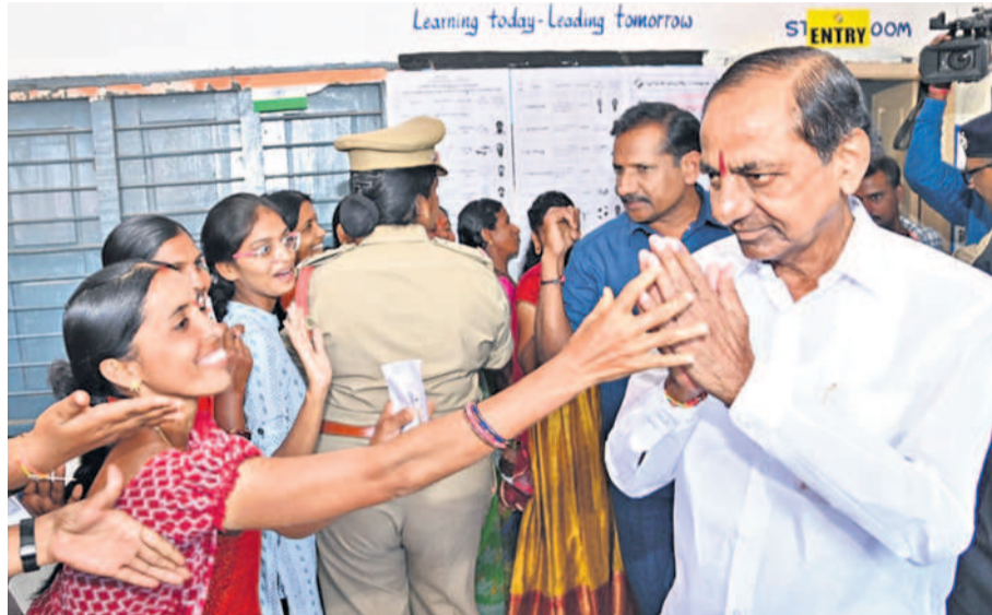
People greet Chief Minister and BRS president K Chandrashekar Rao at a polling booth in Chintamadaka village, Siddipet district, on Thursday.

Polling commenced on a sluggish note early in the day and complaints of Electronic Voting Machines (EVMs) developing snags were reported from differ-