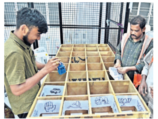
Arrangements under way for the counting of votes in Hyderabad on Saturday.

Shivakumar, before heading to Hyderabad, alleged that the ruling Bharat Rashtra Samithi (BRS) was trying to poach Congress candidates and, at the same time,