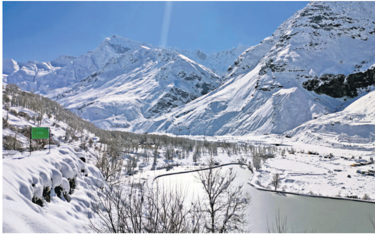
A view of the snow covered-mountains following heavy snowfall, at Koskar in Lahaul and Spiti on Saturday.