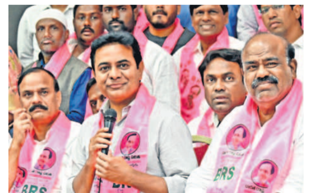
BRS working president KT Rama Rao speaking to media persons at Telangana Bhavan in Hyderabad on Sunday.

"We respect the people's mandate. The result is not what we desired and I appeal to the BRS leaders and