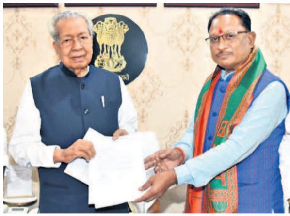
Chhattisgarh CM-designate Vishnu Deo Sai meets Governor Biswabhusan Harichandan to stake claim to form govt.

As a Chief Minister, Sai said he would try to fulfil PM Modi's "guarantees" and sanction 18 lakh houses to the beneficiaries of the PM Awas Yojna, who were deprived of the benefits under the erstwhile Congress government, will be the top priority. BJP's three observers — Union Ministers Arjun Munda and Sarbananda Sonowal and party general secretary Dushyant Kumar Gautam — attended the