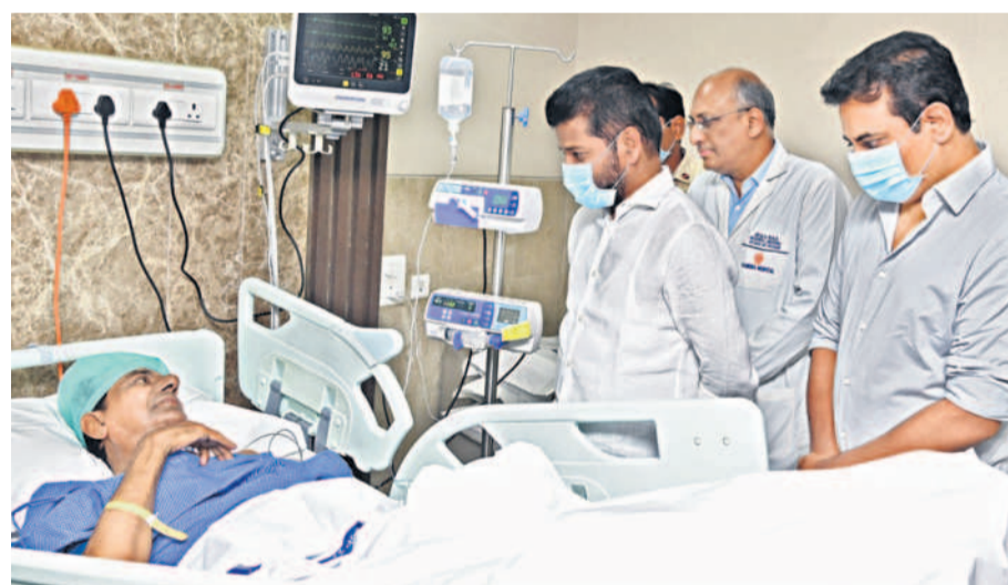
Chief Minister A Revanth Reddy interacts with BRS chief K Chandrashekhara Rao at the Yashoda Hospitals, in Hyderabad on Sunday. BRS working president KT Rama Rao is also seen.

He interacted with BRS working president KT Rama Rao and senior leader T Harish Rao who were present in the hospital, and enquired about the health condition of the former Chief Minister with the team of senior doctors treating him at the hospital. Chandrashekhara Rao had undergone a total hip replacement