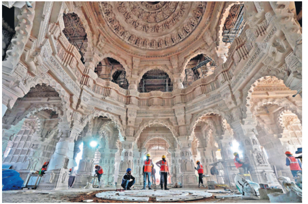
MUCH-AWAITED: The construction work on the Ram Janmabhoomi Temple underway, in Ayodhya. The sanctum-sanctorum is almost complete, according to Shri Ram Janmabhoomi Teerth Kshetra Trust. (REPORT PAGE 7)