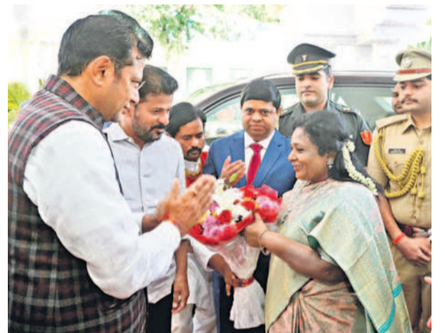
Chief Minister A Revanth Reddy and Legislative Affairs Minister D Sridhar Babu greet Governor Tamilisai Soundararajan.

"We will fill up teacher posts by constructing a