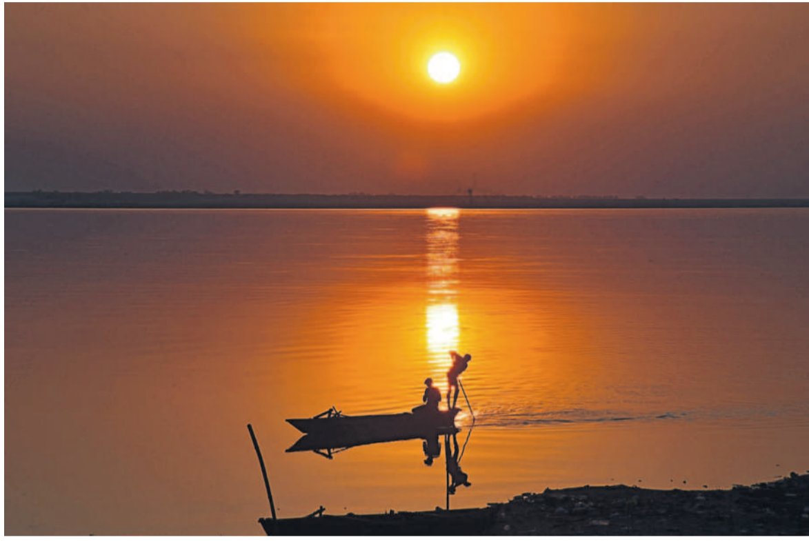
MEN AT WORK: Fishermen silhouetted against the setting sun on the banks of the Brahmaputra river in Tezpur, Assam, on Friday.