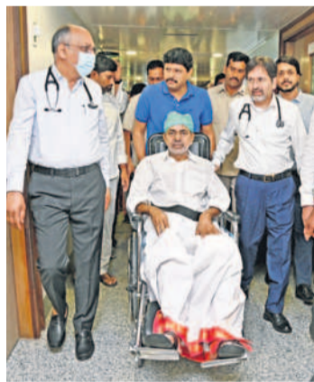
BRS chief K Chandrashekhara Rao underwent total hip replacement surgery.

Chandrashekhara Rao slipped and fell in the bathroom at his farmhouse in Erravelli early on December 8. He was rushed to Yashoda Hospitals in Somajiguda where doctors found a fracture in the left hip bone and performed total hip replacement surgery. He was advised to rest for the next six-eight weeks. The former CM thanked the hospital doctors and nursing staff, who treated him during his stay. He also greeted his supporters, loyalists and fans, who thronged the hospital to meet him. As he reached his residence in Nandinagar directly from Yashoda, he was welcomed by his family.