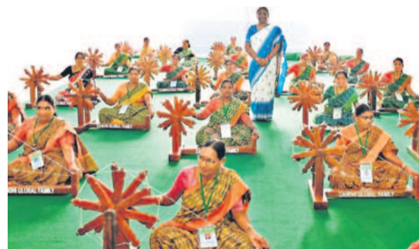
President Droupadi Murmu during her visit to a weavers' cluster in Pochampally on Wednesday.