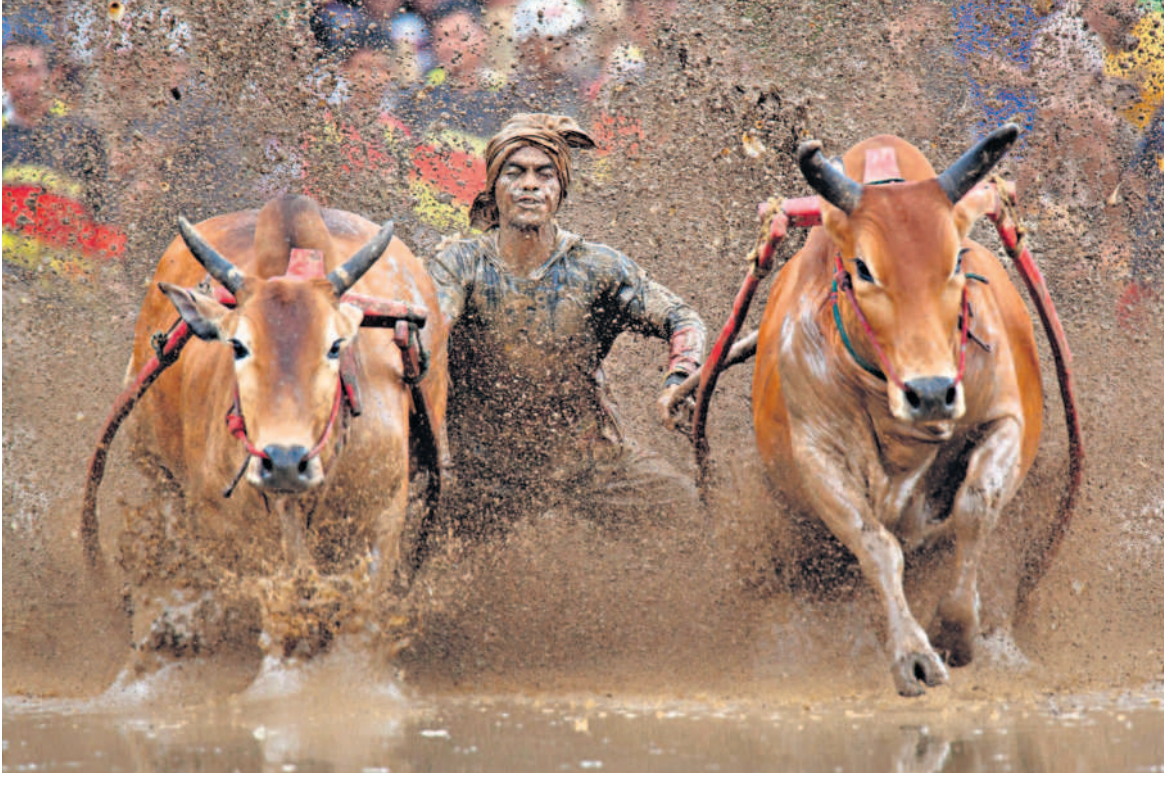
DEEP-ROOTED: A participant takes part in a bull race called 'Pacu Jawi' in Tanah Datar of Indonesia. Held annually to celebrate paddy harvest, the event has now become a major tourist attraction in the region.