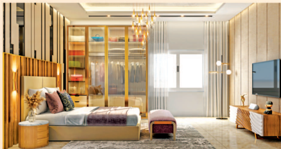
All Images are Artist's Impression

Discover the epitome of urban living at Sansa County, Hyderabad's largest integrated township in Patancheru. Immerse yourself in lush green surroundings, pristine parks, and a serene lake, creating the perfect backdrop for a modern and vibrant lifestyle. Spanning 313 acres, Sansa County seamlessly blends retail and commercial excellence with premium residential spaces, unveiling the secret to holistic living. Elevate your lifestyle with 50+ amenities for an enriched living experience. Your dream life begins here!