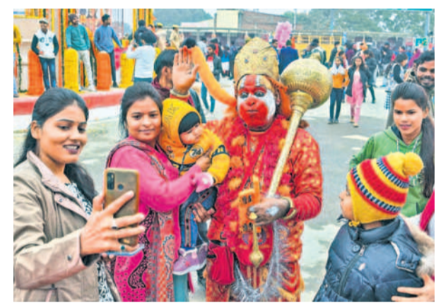
People during a roadshow of Prime Minister Narendra Modi in Ayodhya on Saturday. (REPORTS PAGE 7)

Stressing that the business of people from across the country and the world coming to Ayodhya had started and would go on till eternity, he also appealed for a resolve to make the town the cleanest in the country. Addressing the meeting after inaugurating the Maharshi Valmiki airport and the revamped station named Ayodhya Dham from where he