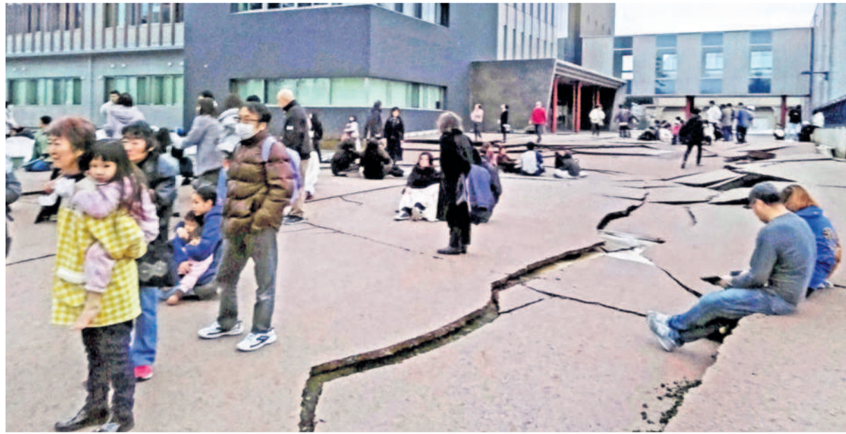
Cracks seen on the ground in Wajima of Ishikawa prefecture on Monday. People were evacuated to stadiums, where they will have to stay for a few days.