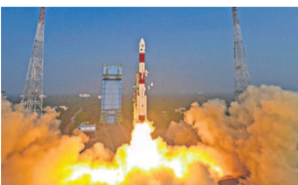
ISRO's PSLV-C58 carrying an X-ray polarimeter satellite and 10 other satellites lifts off from Sriharikota on Monday.

The PSLV-C58 rocket, in its 60th mission, carried the primary payload XPoSats and deployed it in an intended 650 km low earth orbit. Later, scientists performed the orbit-lowering manoeuvre by reducing the altitude to 350 km for con-