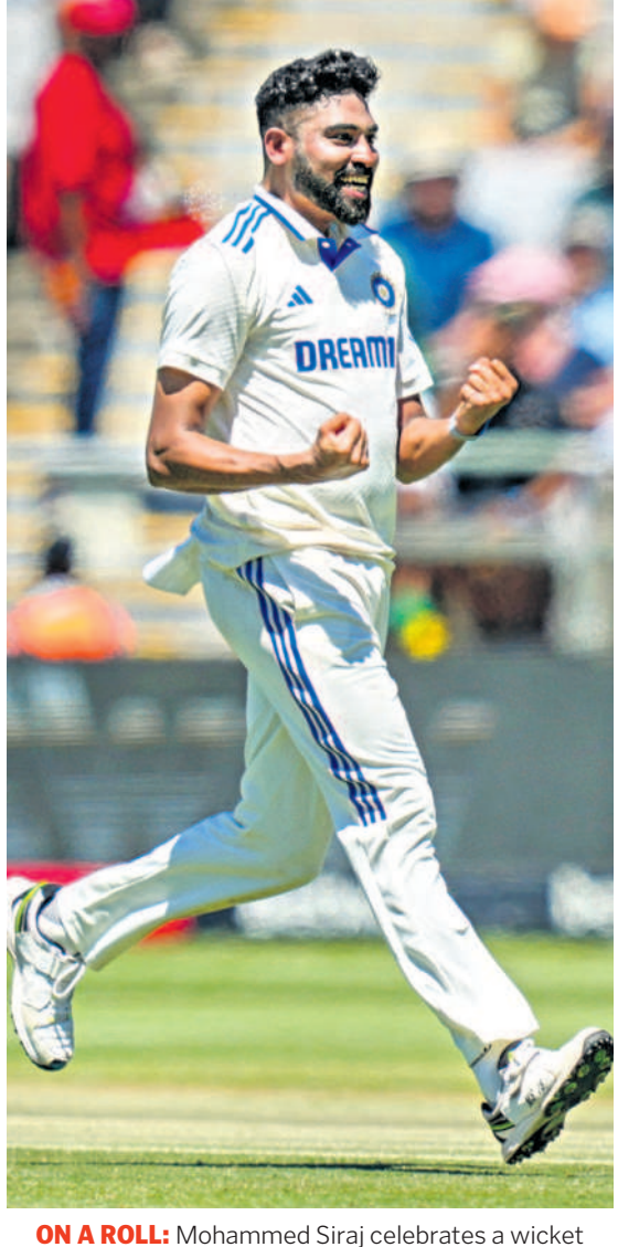
on the first day of the second Test match against South Africa, at the Newlands Cricket Ground in Cape Town on Wednesday. (REPORT PAGE 10)