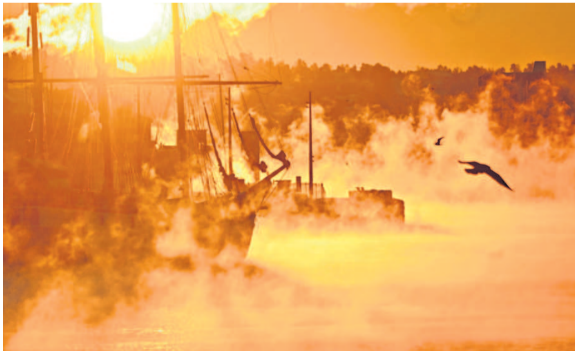
GOLDEN HUES: Vapour rises from the water around a historic tri-master charter sailing ship moored in a port of Oslo on Friday. The temperature dipped to -22 degrees Celsius in the Norwegian capital.