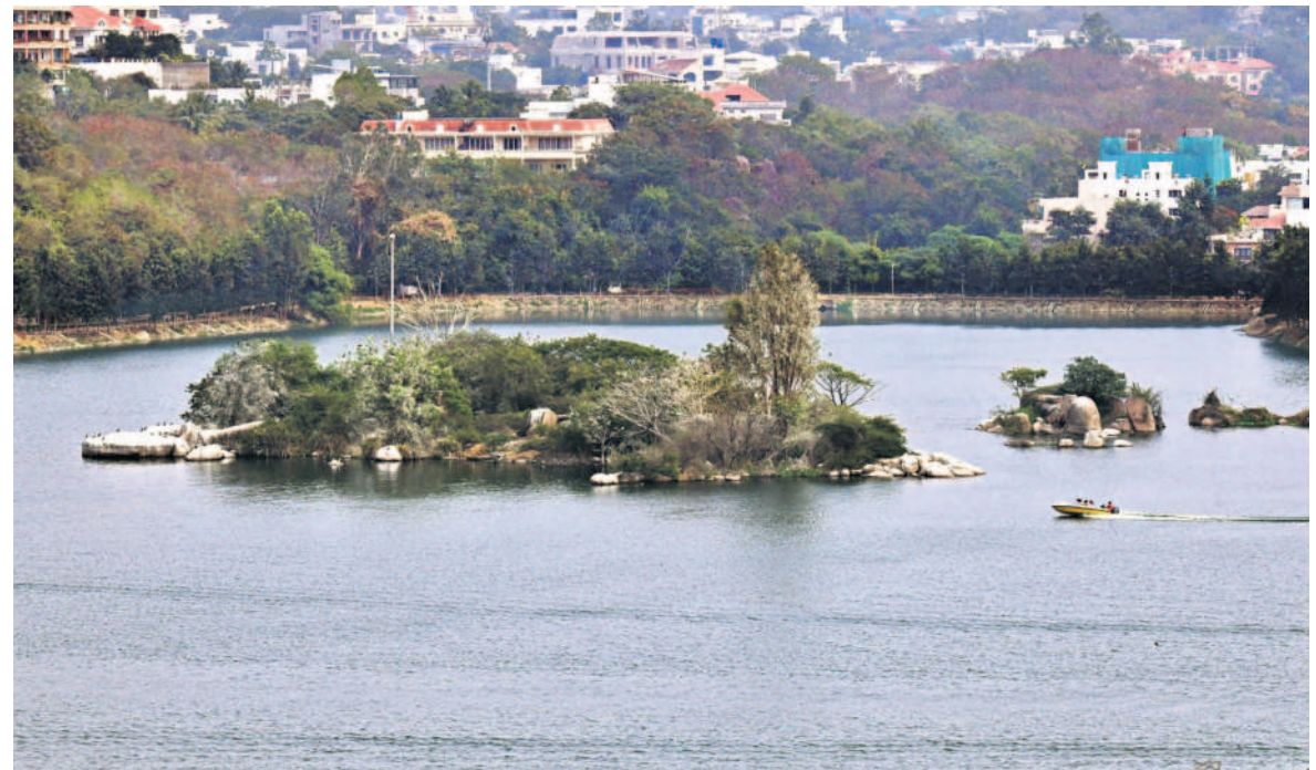
JOY RIDE: People go on a boat ride in Durgam Cheruvu on Tuesday. The day and night temperatures in the city saw a slight rise with minimum temperatures rising above the seasonal average. (REPORT PAGE 3)