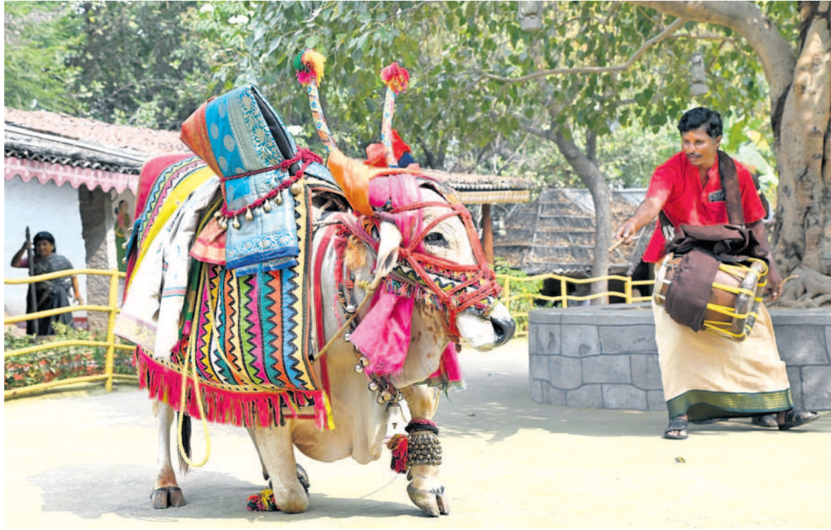
RICH CULTURE: An artiste performs with a Gangireddu ahead of Sankranti, during an event at Shilparamam in Madhapur, Hyderabad, on Saturday.