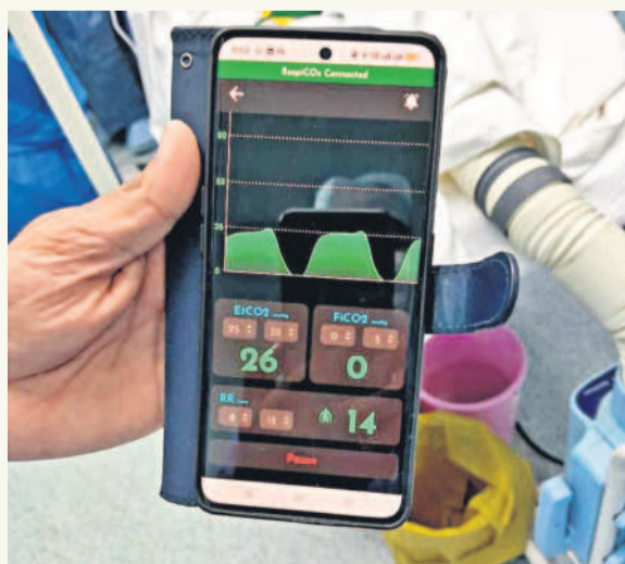
Prototype of the device, named Ecto2monitor capnograph, is already in the testing stage.

The typical consoles that come with a medical device to track respiratory gases such as Oxygen and carbon dioxide in a patient are expensive. Such devices, which are part of the Intensive Care Unit (ICU) set up are high-end and cost anywhere between Rs 1.5 lakh and Rs 2 lakh.