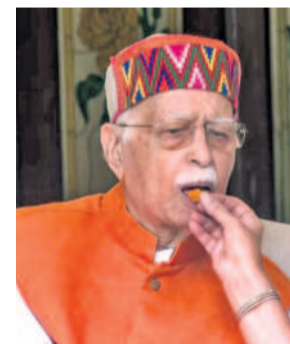
Lal Krishna Advani

Modi was effusive in his praise of the contribution of the BJP's longest-serving president to public life. First in his posts on X and then at a public meeting in Odisha, Modi hailed Advani as one of the most respected statesmen who challenged dynasty politics and connected India's democracy to "all-inclusive and nationalist ideologies." Advani (96) greeted journalists at his home from a distance and