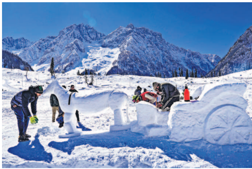
FROZEN ART: Artists giving final touches to a snow horse-cart sculpture at Sonamarg, in Ganderbal district of Kashmir.