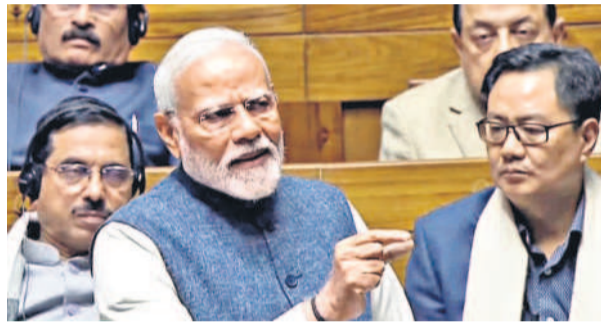
Prime Minister Narendra Modi speaks in the Lok Sabha during the Interim Budget Session, in New Delhi.

In a swipe at the opposition which has constantly targeted the BJP over the temple issue, he said, "This