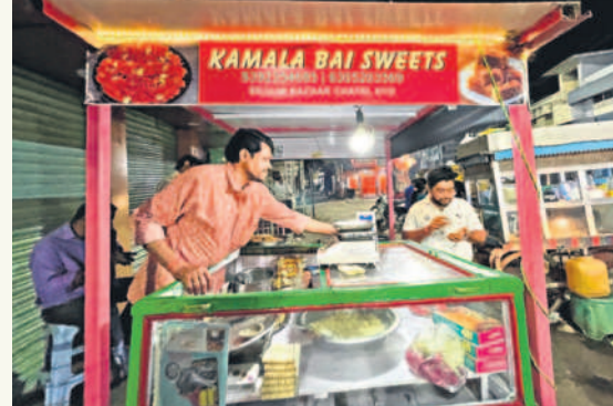
Kamala Bai Sweets sells only five varieties that are sold between 7 pm and 11 pm every day.