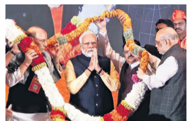
PM Narendra Modi being garlanded by Ministers Rajnath Singh, Amit Shah during the BJP National Convention.

Addressing nearly 11,500 BJP delegates from across the country at Bharat Mandapam here, Modi said he is seeking power not for 'satta bhog' (enjoying power) but for the country's benefit, and slammed the opposition, especially the Congress, saying they make all kinds of false promises but lack a road map for making the country developed. This is something only the BJP