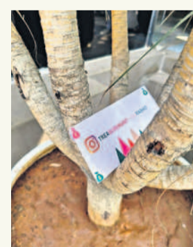
In the game, envelopes filled with cash are placed at undisclosed locations.

For the past ten days, the Instagram page, with the handle @treasure-hunthyderabad, has been orchestrating cash treasure hunts by strategically placing envelopes filled with cash at undisclosed locations across the city. Each hunt begins with a video hint dropped on