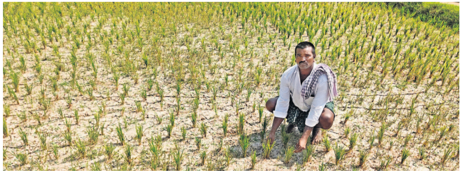
Farmers across Telangana are a worried lot as the State's groundwater table dries out.

Average levels down to 7.72 mbgl in January, lowest in half a decade