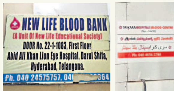
The New Life Educational Society Blood Centre at Darulshifa and Sri Kara Hospital Blood Centre at Madinaguda.

It also conducted raids at another blood bank, Haemo Service Laboratories, which is located in a residential building at Bhavani Nagar, Moosapet,