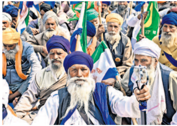
Farmers gather at the Shambhu border during their 'Delhi Chalo' protest, near Patiala on Monday.

Say will peacefully march to Delhi at 11 am tomorrow