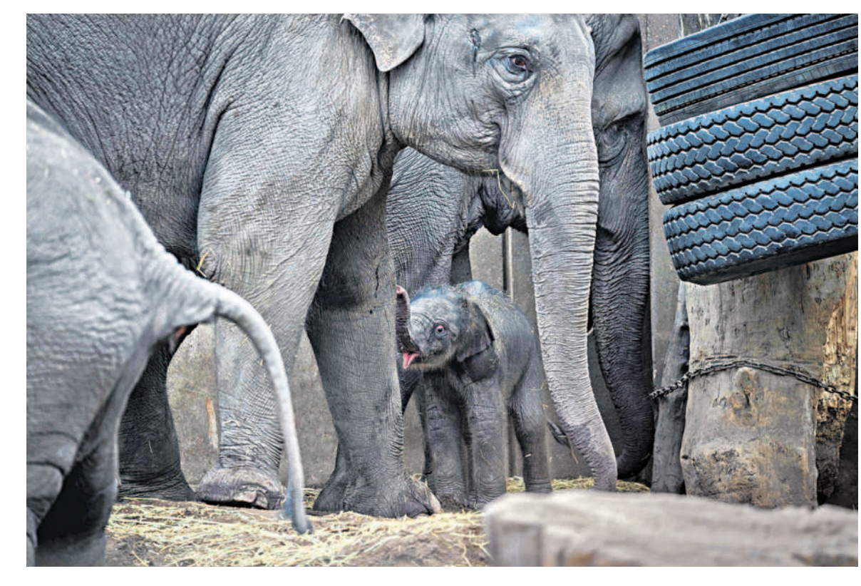
DAY OUT: A newborn female elephant calf at the zoo in Copenhagen, Denmark, on Tuesday.