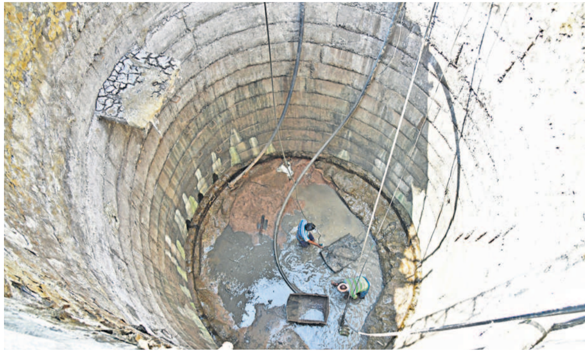
IN CRISIS: An almost dried-up well being revived on the Mugdampur outskirts of Karimnagar district on Wednesday. With no irrigation water available and summer fast approaching, farmers are facing severe hardships.