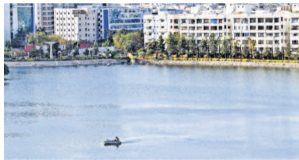
Temperatures are likely to rise in mid-March across Hyderabad.