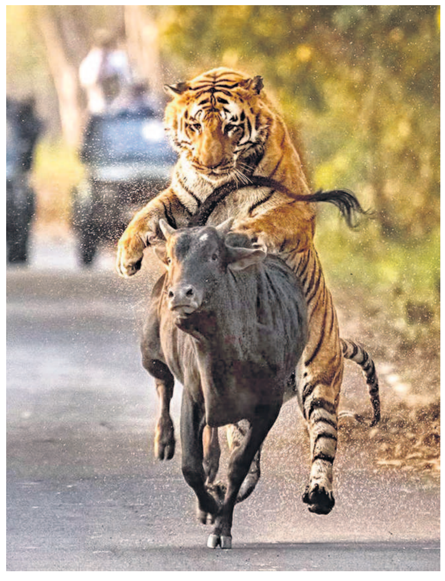
IN ACTION: Hyderabad wildlife photographer Jeetendra Chaware captures the moment of a tiger attacking a bull in Uttar Pradesh's Philibit Tiger Reserve.