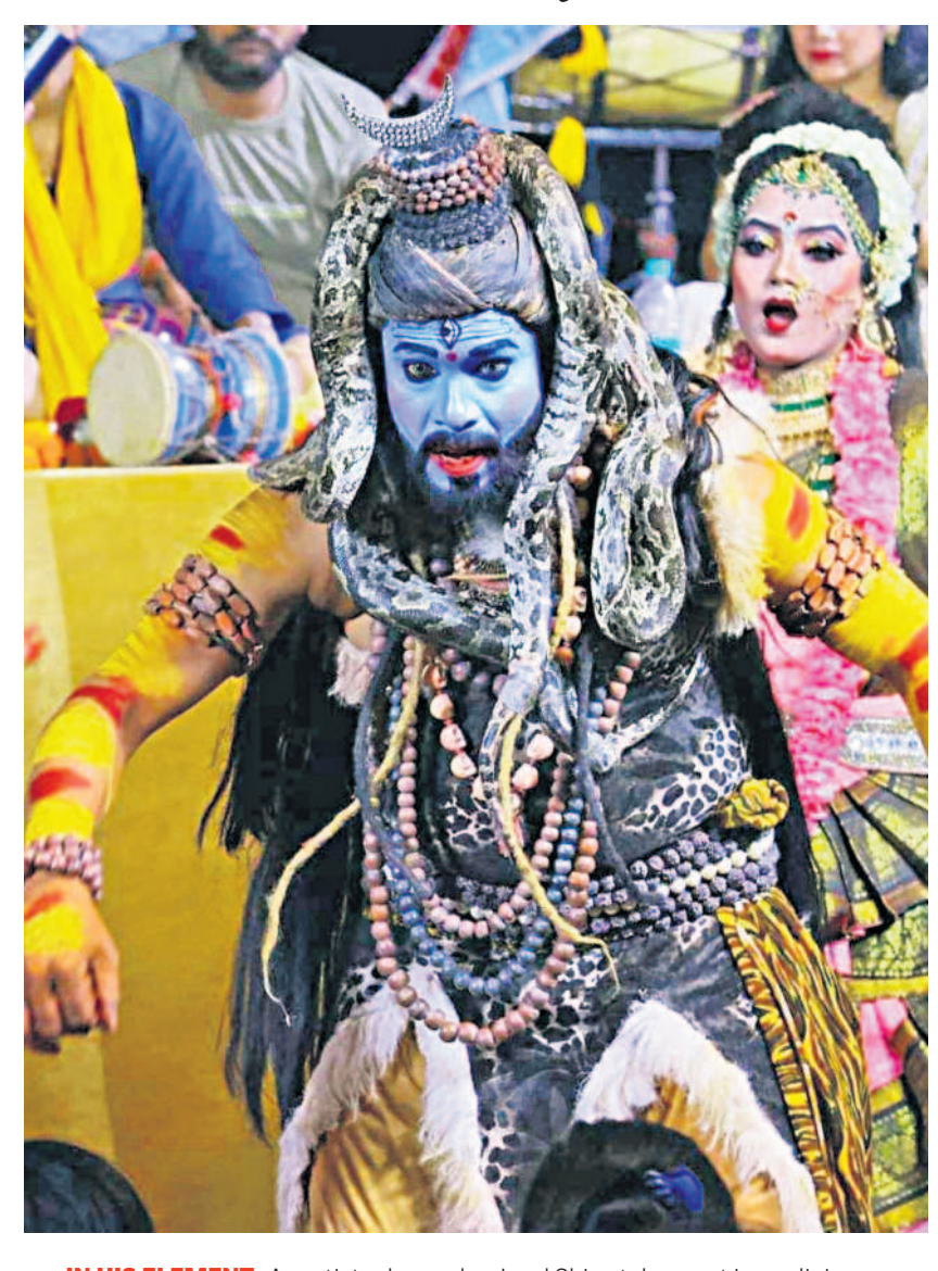
IN HIS ELEMENT: An artiste dressed as Lord Shiva takes part in a religious procession on the eve of Mahashivratri, in Ranchi on Thursday.