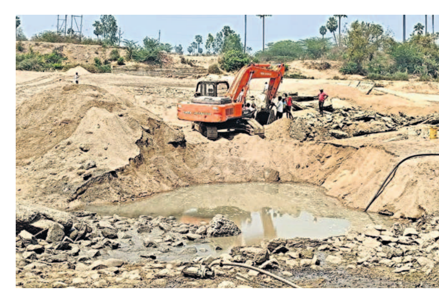
PARCHED: With the Akeru Vagu at Narsimhulapet mandal in Mahabubabad district drying up, farmers are forced to hire earthmovers to dig pits to source water for irrigation purposes. (REPORT PAGE 4)