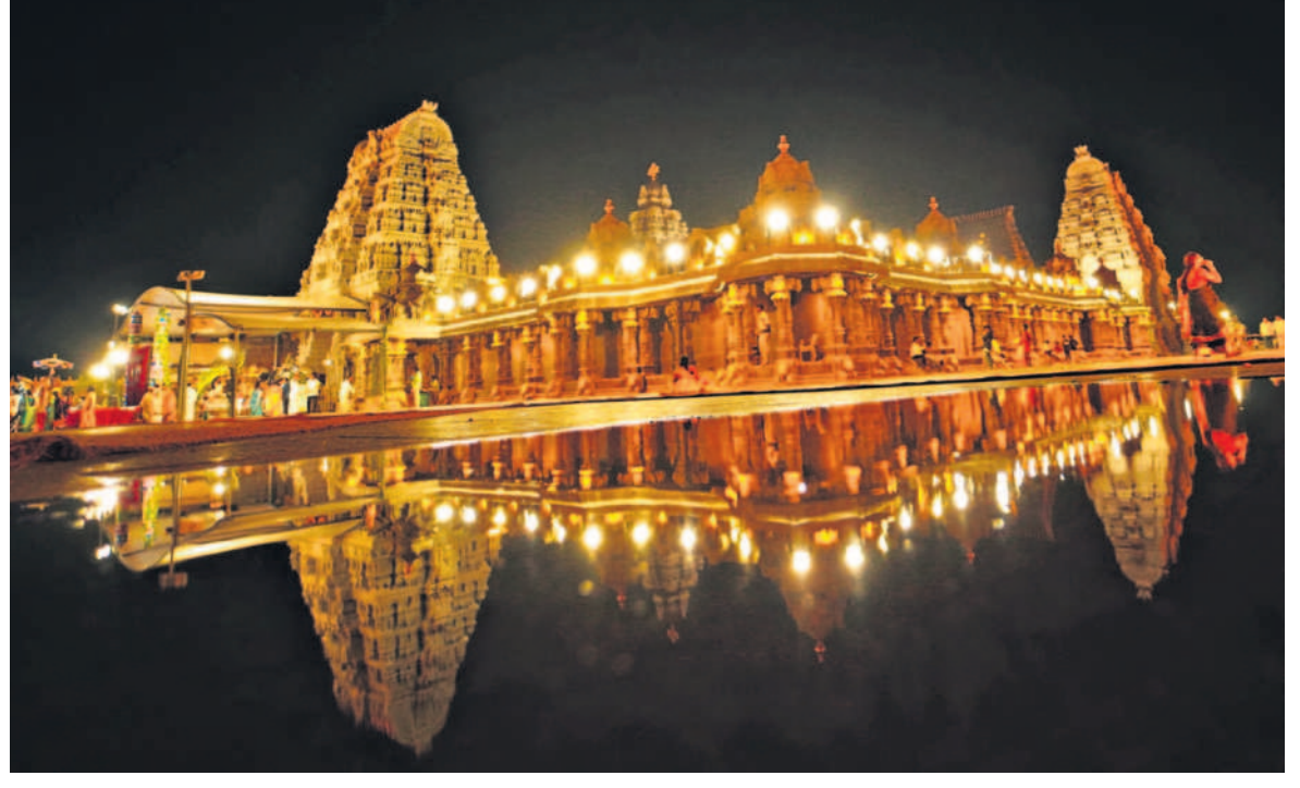
GRANDIOSE: The Lakshmi Narasimha Swamy Temple at Yadadri illuminated for the ongoing Brahmotsavams is reflected in the rainwater after a brief spell of showers lashed the region on Wednesday evening.