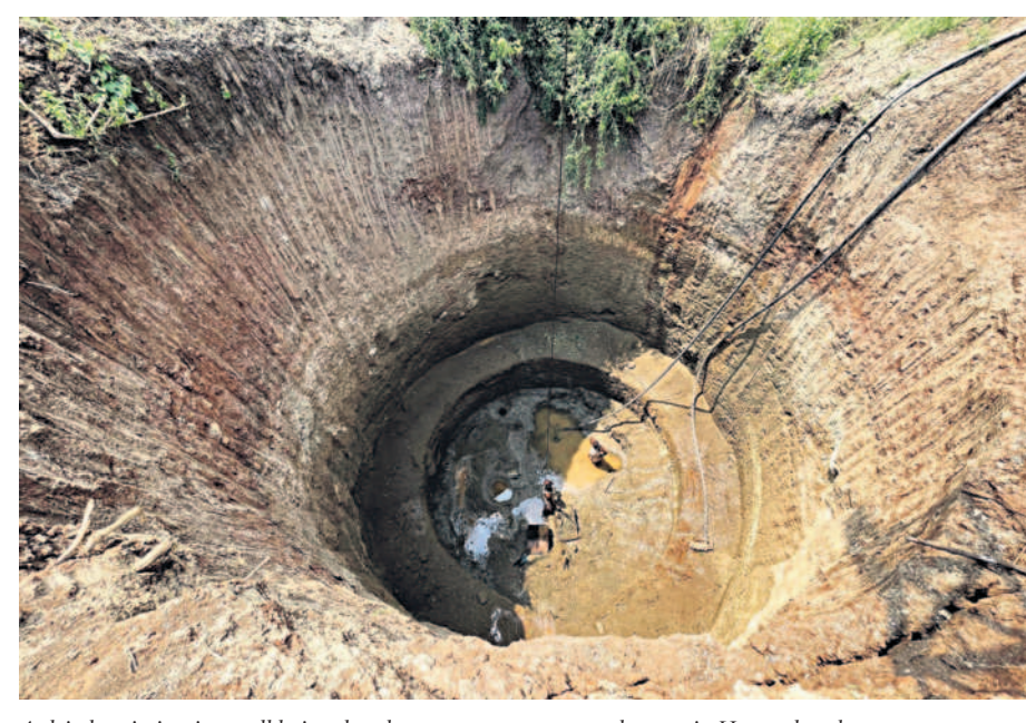
A dried up irrigation well being dug deeper to extract groundwater, in Hanamkonda.

The right canal of the Nagarjuna Sagar Project was closed on Sunday after releasing 5 TMC of its allotted quota to Andhra Pradesh. The project was left with hardly 8 TMC of water above the MDDL of 510 feet.