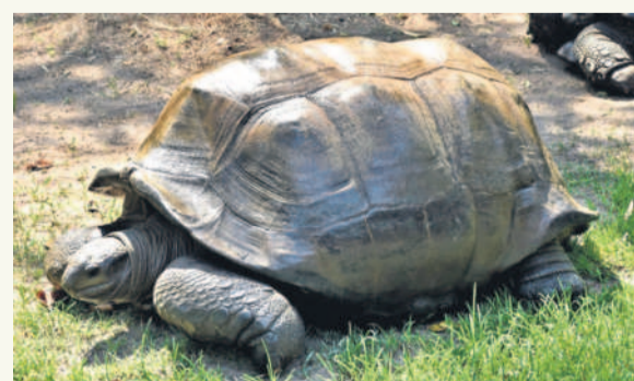
The Galapagos Giant Tortoise died due to old age complications early on Saturday.

The initial postmortem report revealed that the tortoise died due to multi-