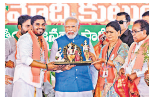
Prime Minister Narendra Modi being presented a memento at a public meeting in Nagarkurnool on Saturday.

Addressing a public meeting at Nagarkurnool on Friday, Modi said the BRS had first destroyed the dreams of the people of Telangana of developing the State in all the fields in the last 10 years and now, the "corrupt" Congress had come to power in the State to stop the development. "It is the bad luck of the people of Telangana that first they trusted the BRS and now the Congress. Both