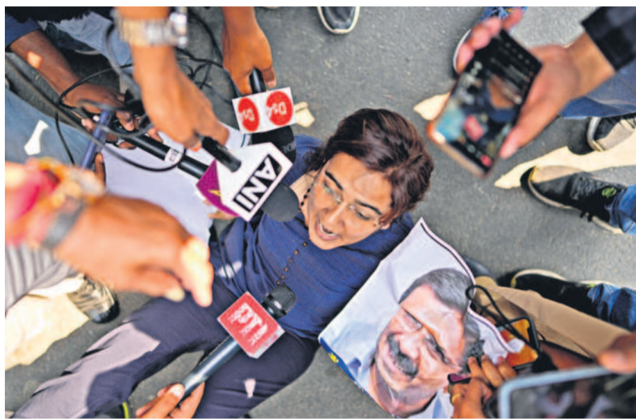
An AAP supporter raises slogans as she is detained by police during a protest against the arrest of Chief Minister Arvind Kejriwal, in New Delhi on Friday. (REPORTS PAGE 7)

The law officer said the money trail showed that Rs 45 crore "kickback" used in