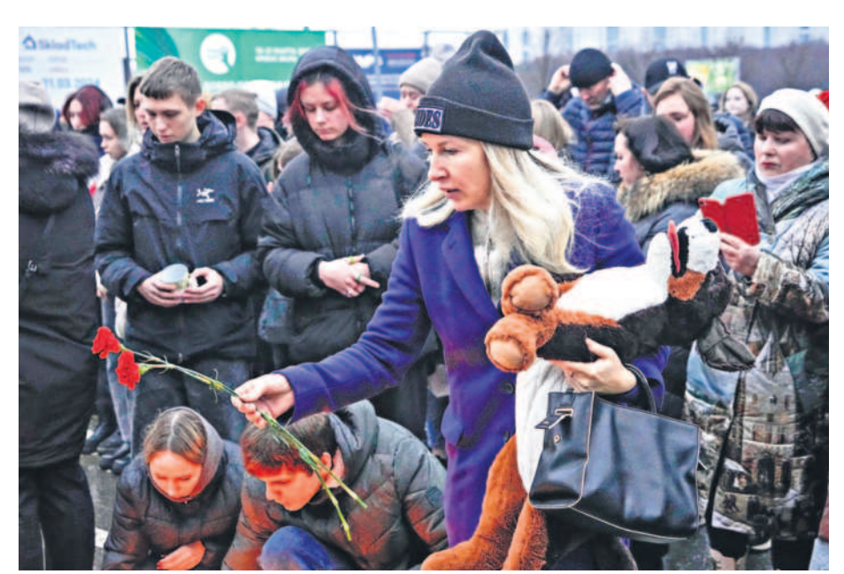
A woman places flowers next to the Crocus City Hall, near Moscow, on Saturday.

Ukraine has strongly denied any involvement and accused Moscow of using the attack to try to stoke fervour in its war effort. Putin said authorities have detained 11 people in the attack. In an address to the nation, Putin called it "a bloody, barbaric terrorist