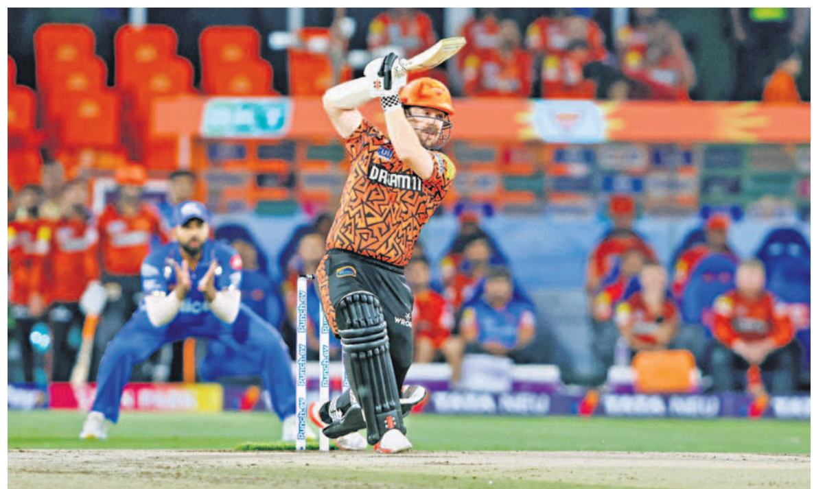
ON A SONG: Sunrisers Hyderabad's Travis Head plays a shot during the match against Mumbai Indians, at the Rajiv Gandhi International Stadium in Hyderabad. SRH beat MI by 31 runs. (REPORT PAGE 10)