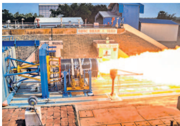
Called Kalam-250, the high-strength carbon composite motor will carry rocket from atmospheric phase to deep vacuum of outer space.

The 85-second test recorded a peak sea-level thrust of 186 kilonewtons (kN), expected to translate to around 235kN in flight. Kalam-250 features a high-strength carbon composite rocket motor using solid fuel and an Ethylene-Propylene-Diene terpolymer (EPDM) thermal protection system (TPS). It