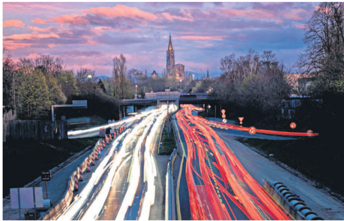
FAST-PACED: Multiple long exposures show an urban highway after sunset, with the Notre-Dame cathedral in the background, in Strasbourg, eastern France, on Thursday.