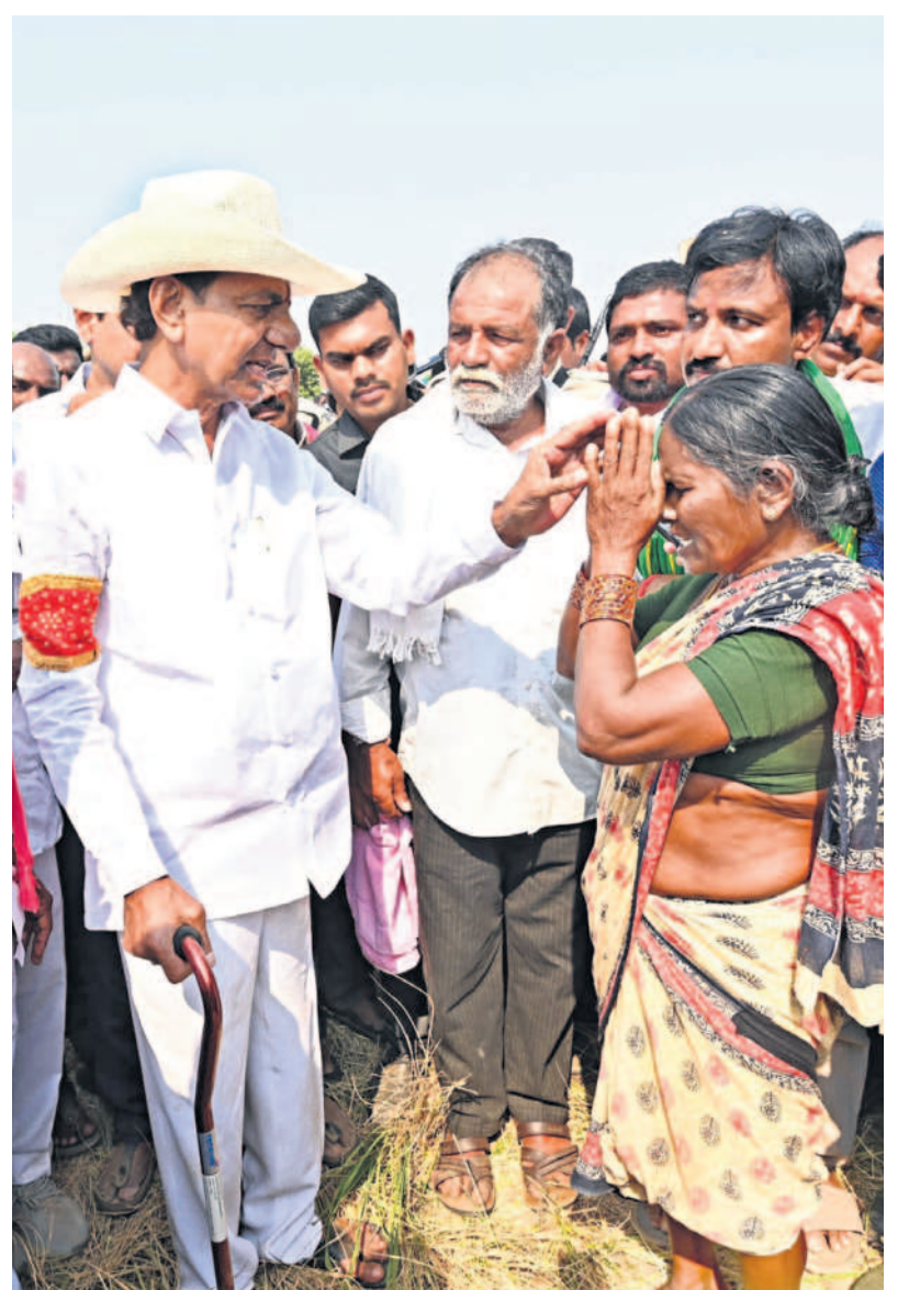
BRS president and former Chief Minister K Chandrashekhar Rao interacts