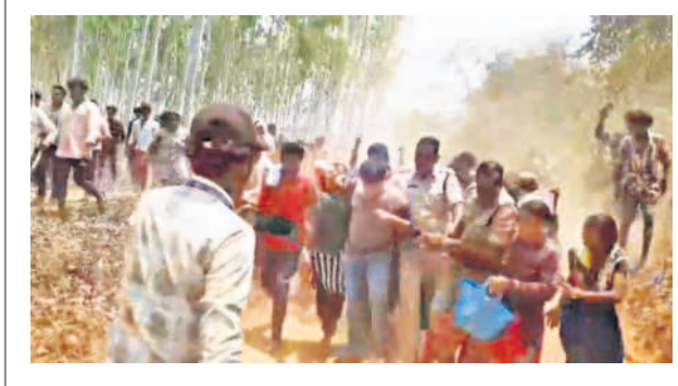
Cops detain tribals, who attacked police personnel, at Buggapadu village of Sathupalli mandal in Khammam district on Sunday