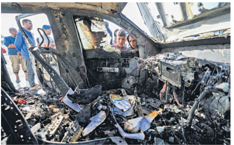
People inspect the site where World Central Kitchen workers were killed in Gaza Strip on Tuesday. The aid group suspended its operations in the region following the airstrike.