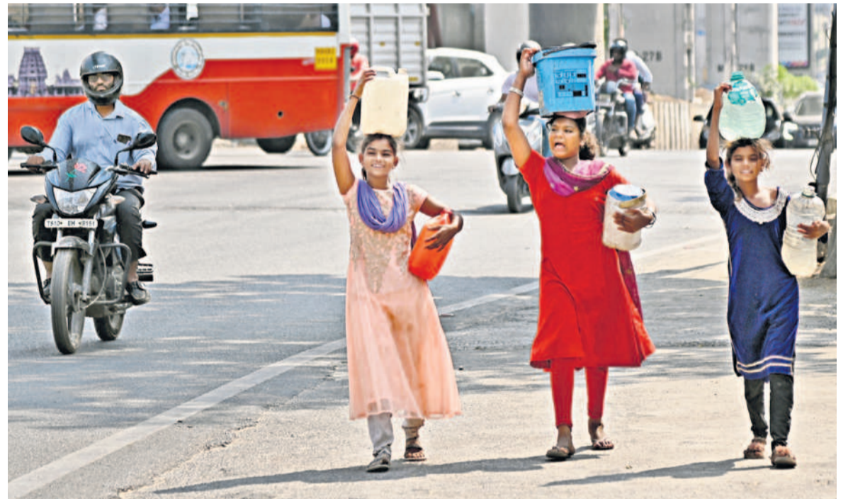
TOUGH LIFE: Women carry water amid soaring temperatures and a worsening water crisis, in Hyderabad on Sunday. Many areas in the State capital are reeling under acute water shortage.