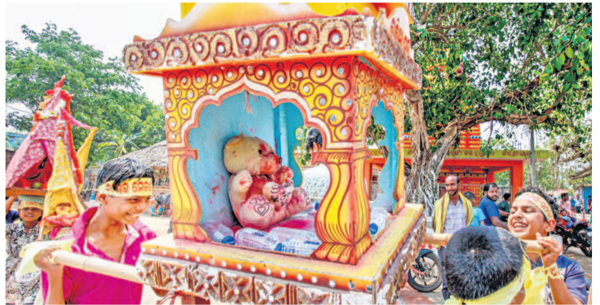
SMALL JOYS: Children carry toys during the Kandhei Melan procession at Bhagabanpur village in Bhubaneswar on Monday. A decades-old event, Kandhei Melan draws huge crowds every year, wherein children decorate their toys, place them in palanquins along with idols of deities and take out a procession.

NATION | PAGE 08 'Joint culture in forces'