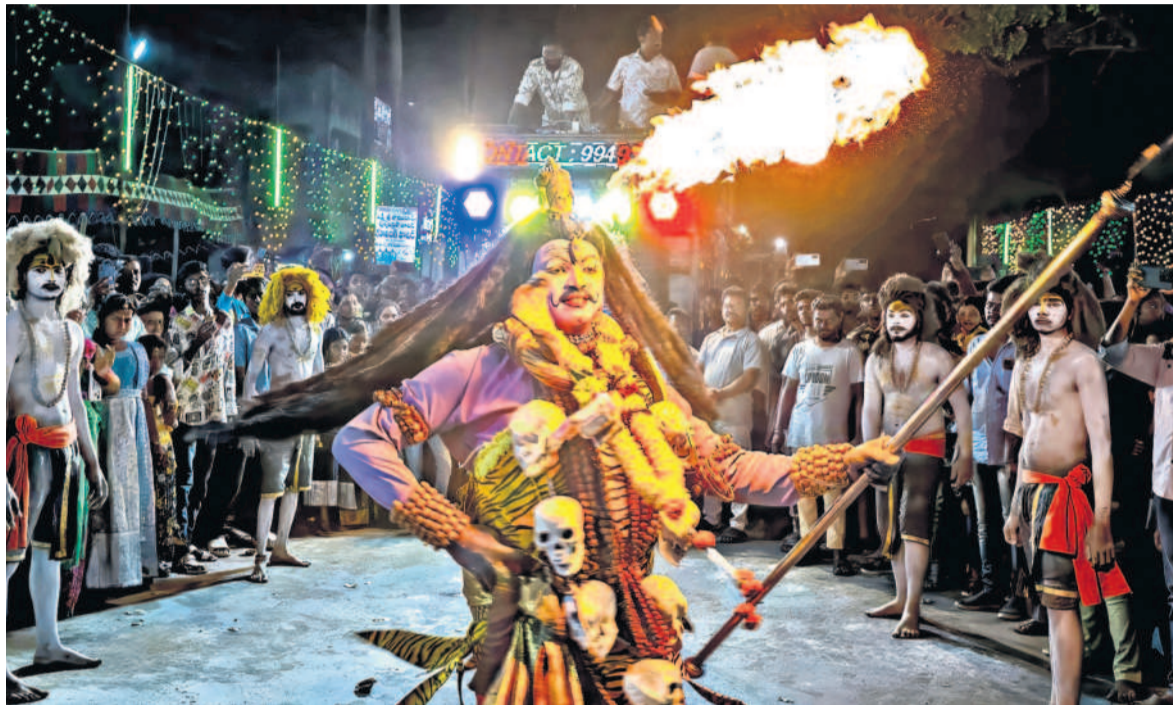
STRONG TRADITION: An artiste dressed as Lord Shiva spews fire during the Shyamalamba Jatara in Katheru village near Rajahmundry, Andhra Pradesh.