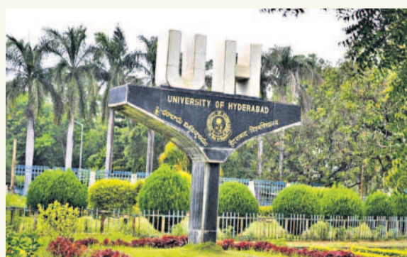
The top-ranked UoH subjects are Biological Sciences, Chemistry, Economics & Econometrics, English Language Literature, Linguistics, Performing Arts and Physics & Astronomy.

As per the QS World University Subject Rankings 2024 released recently, the top-ranked UoH subjects are Biological Sciences, Chemistry, Economics & Econometrics, English Language Literature, Linguistics, Performing Arts and Physics & Astronomy. In academic reputation, the