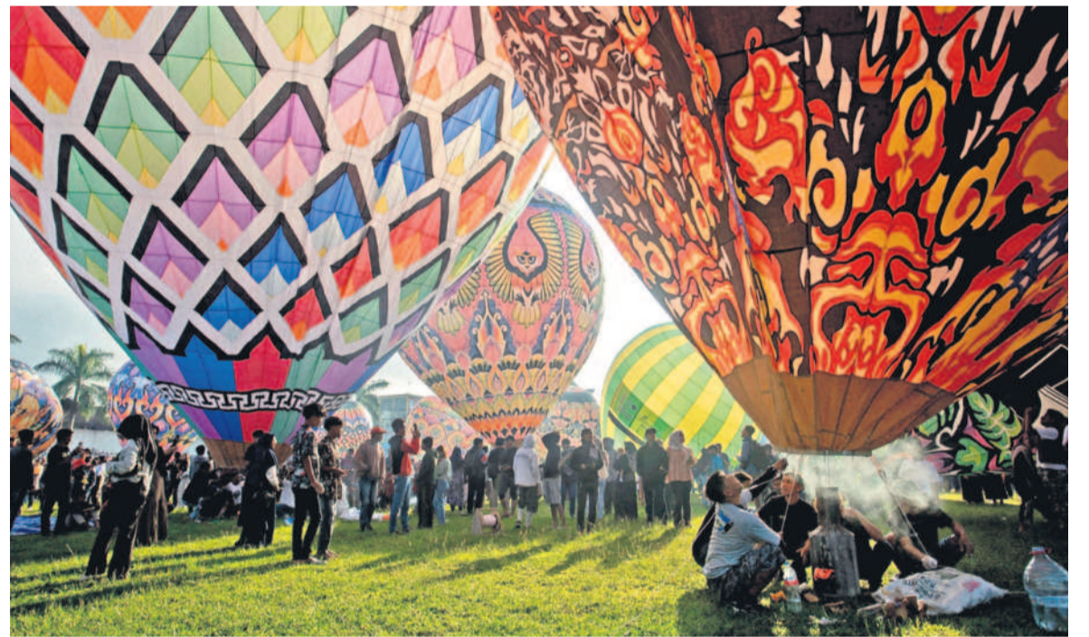
ANNUAL FESTIVAL: Participants prepare to fly hot air balloons during the traditional hot air balloon festival, an annual event since 1950, on Eid ul-Fitr in Wonosobo, Central Java.